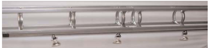
Close up of our track lighting on a truss.